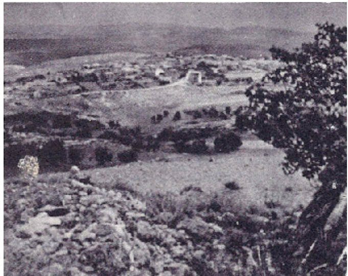
Anathoth. From the mound that covers the site of ancient Anathoth, one can see the modern village of Anata. Anathoth was a city of the tribe of Benjamin in that was assigned to the Levites (Josh . 21:18). It was the home of the high priest Abiathar (1 Kings 2:26), the prophet Jeremiah (Jer. 1:1), and David's famed warrior, Jehu (1 Chron. 12:3). Today the site is known as Ras el-Harrubeh; it is located about 5 km. (3 mi.) north of Jerusalem.

Arad ("wild ass"), a Canaanite city in the wilderness of Judea (Josh. 12: 14). See also "All the People of the Bible."