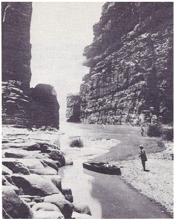
Arnon River . Sometimes described as the "brook" Arnon, the mighty Arnon River carves a deep gorge that bisects the highlands east of the Dea Sea. For this reason, the Arnon is nearly always mentioned in the Bible as a frontier-first as the southern frontier of the Amorites, and later as a border of Reuben (Num. 21:13).

Ashdod [Azotus] ("stronghold"), one of the five chief Canaanite cities; the seat of the worship of the fish