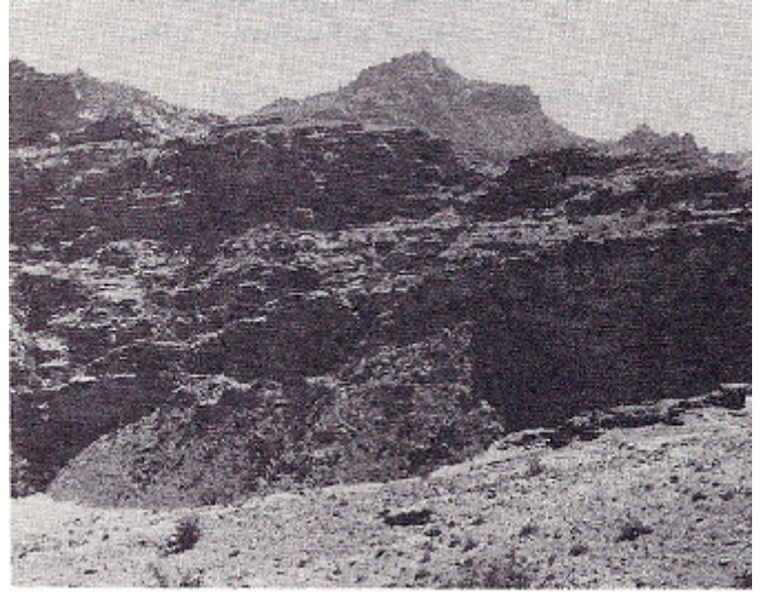
Mount Hor. The burial place of Aaron (Deut. 32:50), Mount Hor is traditionally identified with the modern-day peak of Jebel Nebi Harun. Over 1,500 m. (4,800 ft.) high, the mountain stands to the west of Edom.

In a few cases, our English versions use the same word to transliterate several similar Hebrew names. In these instances, we have recorded a separate entry for each Hebrew name (e.g., Iddo).