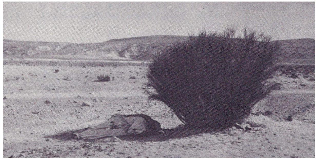
Traveller's rest, Kadesh . An Arab traveller dozes beneath a broom bush in the wilderness along the Negev Desert. In this same area Elijah stopped to rest beneath a juniper tree and received encouragement from an angel of the Lord (1 Kings 19:4-7).

Elihu ("God himself"). [1] One who joined David at Ziklag (1 Chron. 12:20). [2] A porter at the tabernacle at the time of David (1 Chron. 26:7). [3] The youngest "friend" of Job (Job 32:2,4-6). [4] See Eliab [3]. [5] See Eliab [4].